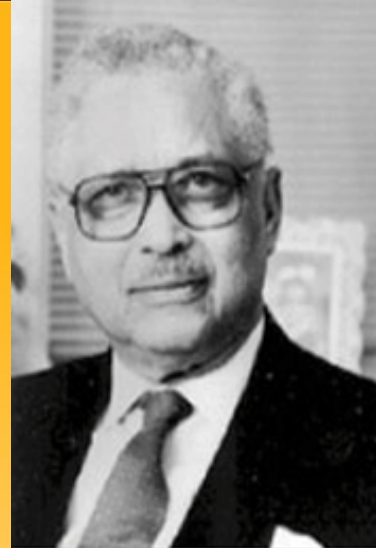
Rev. Leon H. Sullivan, Founder

Our philosophy of self-help and the system of developing the whole person enables individuals to become self-sufficient, productive workers.